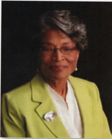
Dr. Eva M. Clayton

United States Congresswoman Eva M. Clayton was born in Savannah, Ga., on September 16, 1934. In 1955, Clayton received her Bachelor of Science degree in biology from Johnson C. Smith University and her Master of Science degree in biology from North Carolina Central University in 1962. Clayton also attended law school, and she is the recipient of eight honorary doctorate degrees from various universities for her leadership and service.