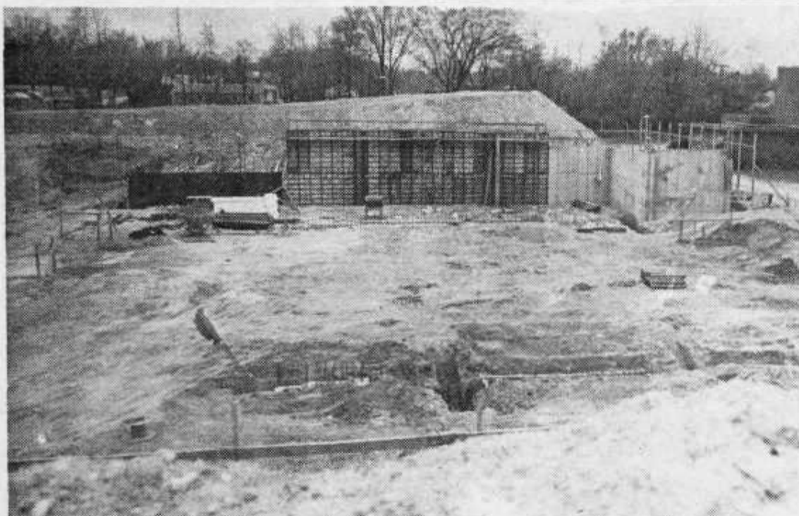
It looks like the gym is going to be more than a hole in the ground

Gray commented that the land is to be used for the further development of A&T; but no specific project was revealed.