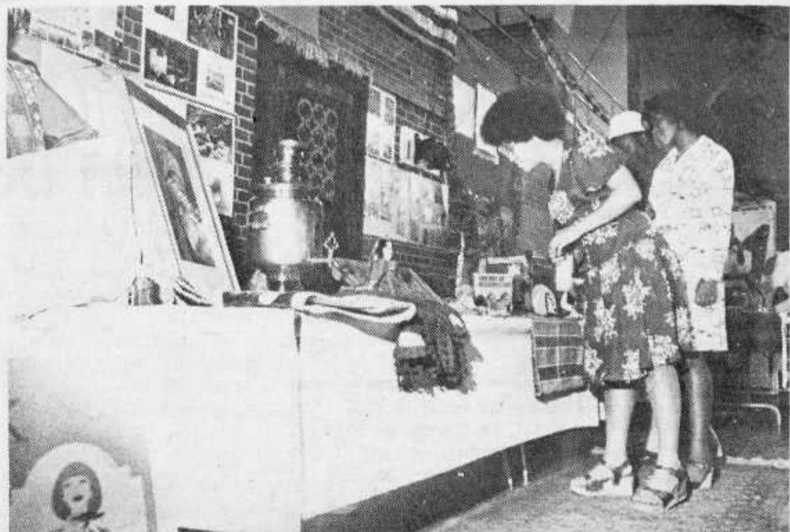
These young ladies are enjoying the wonders of far away lands.

The presentation of this (intercultural) program was sponsored by the International Students' Association and The Committee on International Programs.