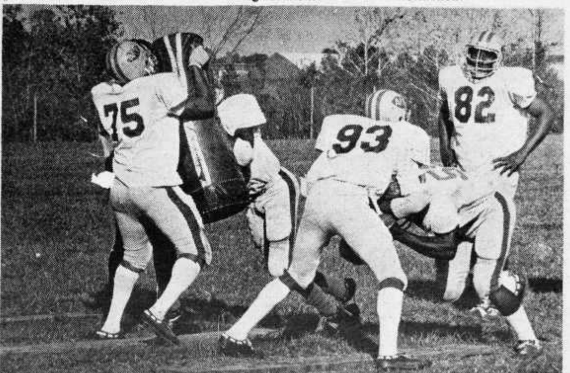
This Saturday the Bison of Howard University will invade Aggie territory. Here members of the Aggie football team practice up on some dummies. Kickoff for the Howard-A&T battle is 1:30.