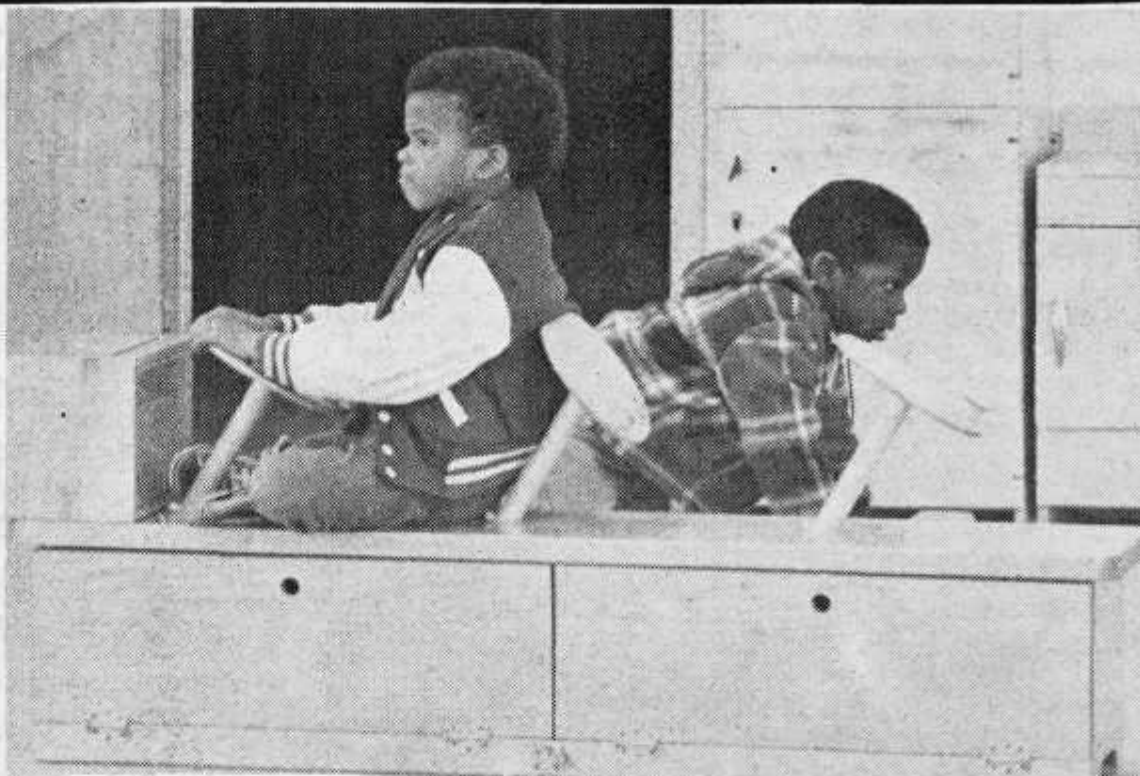
Richard Petty, look out, it's only a matter of time before the "Kid" is unleashed.

At issue this time is program duplication, an issue that has