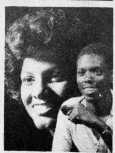
CHRISTMAS SPECIAL BIG 8X10 NATURAL COLOR

SPECIAL EFFECTS 2 weeks only $3.00 X-tra Novembers 27-December 9 (Plus your weight a penny a pound) GIVE A GIFT OF LOVE FOR CHRISTMAS UNIVERSITY STUDIO, INC. CALL: 275-2559 1107 E. Market St. (Directly Across From Coltrane Hall)